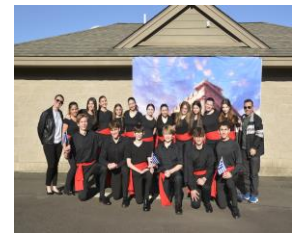
Greek Dance Performers