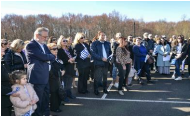
The Closter Greek Americans