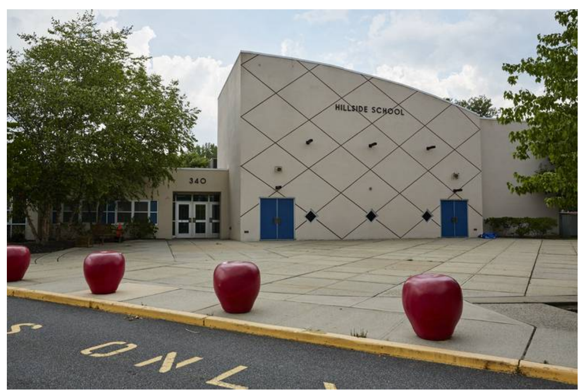
Hillside Elementary School.

Schools: Hillside Elementary School serves students in prekindergarten through fourth grade; 84% met English Language Arts standards and 83% meet math standards in the 2014-15 school year, according to the state education department. Tenakill Middle School serves students in grades five through eight; 86% met reading standards and 77% met math standards the 2014-15 school year, data show. High-school students attend Northern Valley Regional High School in Demarest. The average SAT scores of the 2015 graduating class were 583 in critical reading, 618 in math and 606 in writing, according to the school's website.