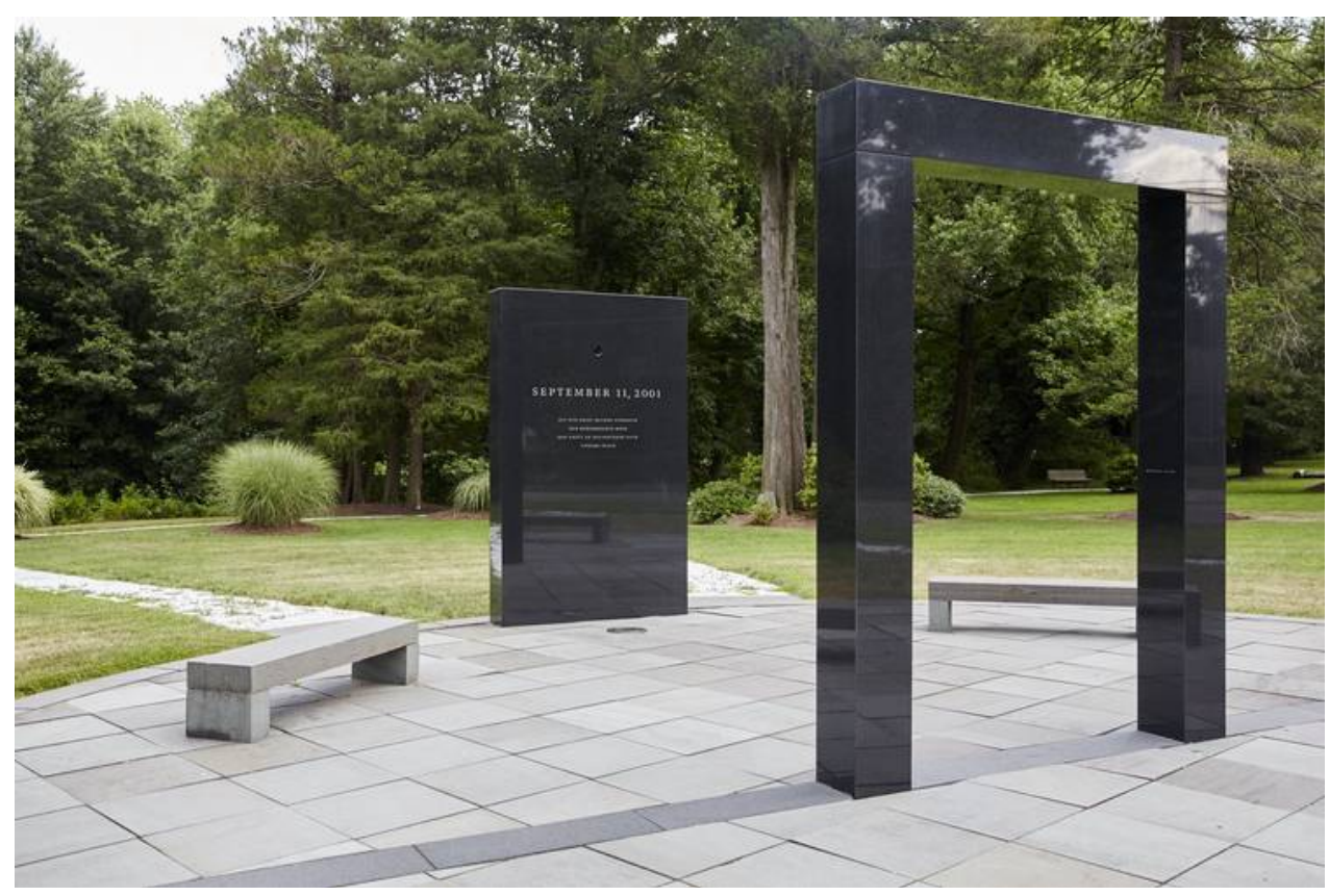
9/11 Memorial Park.

Parks: The Closter Nature Center covers 136 acres that include ponds, brooks, meadows and forests. Veterans Memorial Park has ball fields, a playground and a band shell. Mollicone Park is home to another baseball field. Schauble Park has a jogging path, a playground and more ball fields. Amendola Park is a quieter place that the parks department reports is good for meditation. Ruckman Park has tennis courts, a roller rink and a playground. High Street Park has a playground and workout stations.