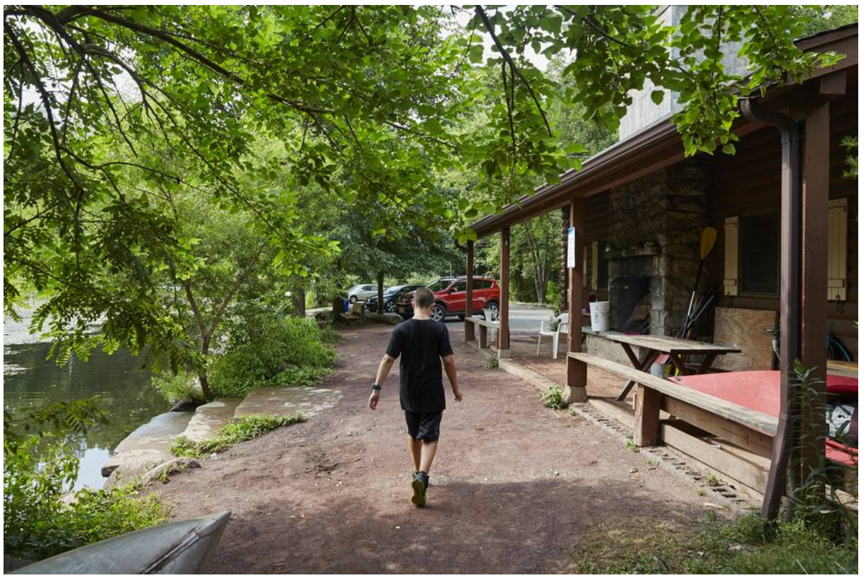
The Closter Nature Center in Closter, N.J., covers 136 acres that include ponds, brooks, meadows and forests.

By KATHLEEN LUCADAMO Updated July 29, 2016 12:17 p.m. ET