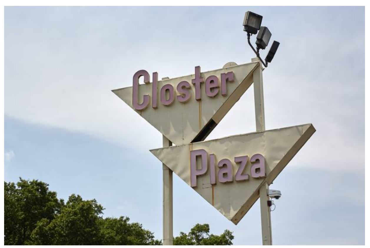
The new Closter Plaza is getting a Whole Foods Market. Celebrity chef Jose Garces has plans to open two restaurants.

The lineup of new tenants includes Target; Whole Foods Market, which plans to open this fall; CycleBar, an indoor cycling studio; Bareburger, a restaurant chain that dishes up organic and all-natural meat and produce; Indigo Chic Boutique; BlueMercury, a beauty products store; and a Cinemex movie theater. Kidville, a place for children, is already open.